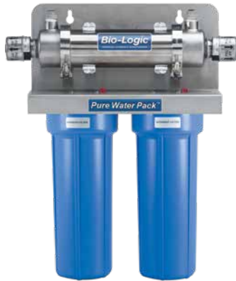
Model BIO-1.5 PWP 1.5 GPM