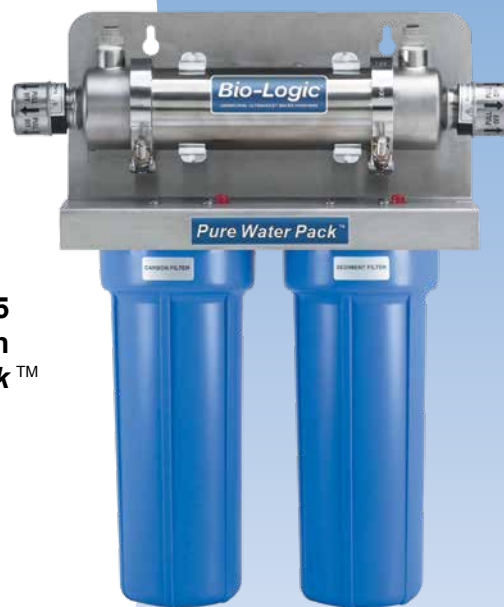
Model BIO-1.5 1.5 GPM with Pure Water Pack™