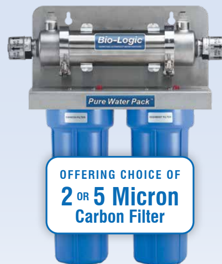
Model BIO-1.5 PWP 1.5 GPM