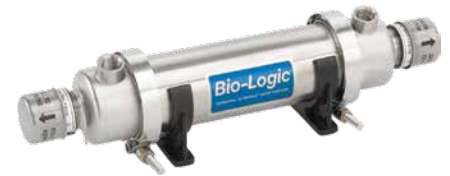
Model BIO-1.5 1.5 GPM

The Bio-Logic® Pure Water Pack™ has been designed to provide adequate filtering and germicidal ultraviolet dosage.