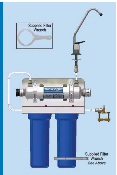
Model BIO-1.5 PWP 1.5 GPM