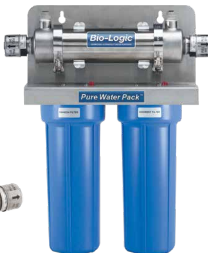
Model BIO-1.5 PWP 1.5 GPM