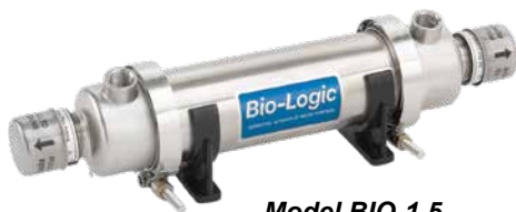
Model BIO-1.5 1.5 GPM

Since 1963 , we've been engineering and manufacturing germicidal ultraviolet equipment to prevent disease caused by contaminants in water, in air, and on surfaces. Our engineers bring each concept to a finished model, implementing stringent quality control procedures. Each product is manufactured with stainless steel and the highest quality materials to ensure the safety of personnel and room occupants. We stock an extensive inventory in our 37,500 square foot facility and ship throughout the world. Our knowledgeable team of UV-C specialists will provide effective and cost-conscious solutions for your home, business, industry, or institution.