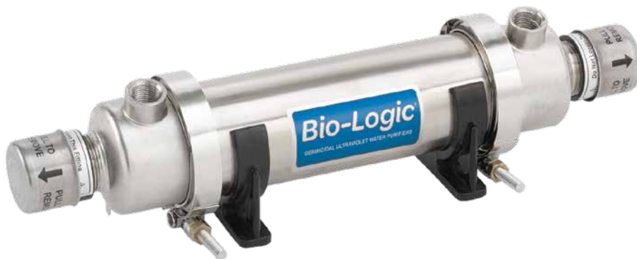
Model BIO-1.5 1.5 GPM