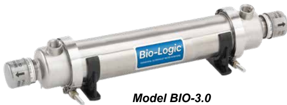
Model BIO-3.0 3.0 GPM