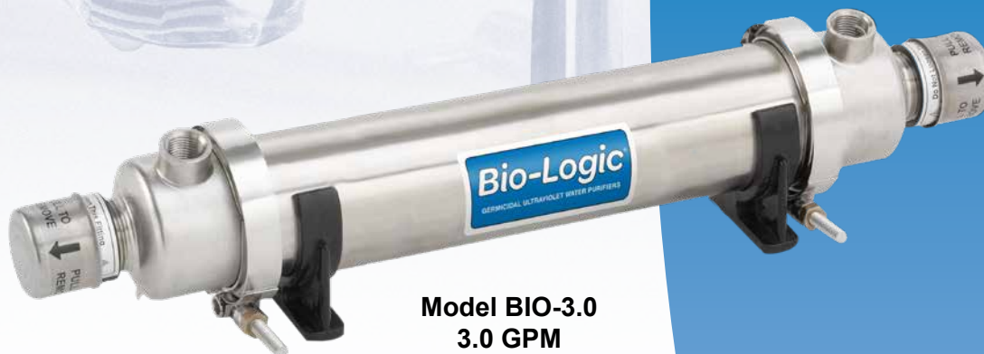
Model BIO-3.0 3.0 GPM