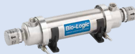
Model BIO-1.5 1.5 GPM