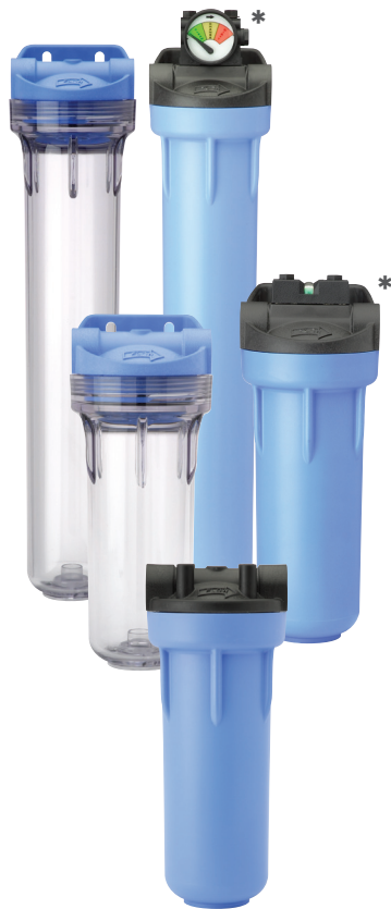
*Shown with differential gauge. Gauges sold separately.

VERSATILE DESIGN ACCEPTS MULTIPLE CARTRIDGE SIZES IN A VARIETY OF APPLICATION SETTINGS