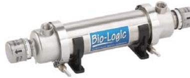
Model BIO-1.5 1.5 GPM