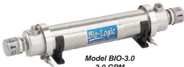
Model BIO-3.0 3.0 GPM