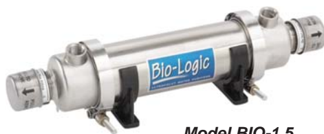
Model BIO-1.5 1.5 GPM

Bio-Logic® Ultraviolet Water Purifiers are the ideal solution for an ever growing range of water treatment applications.