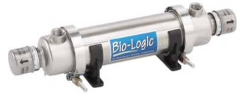
Model BIO-1.5 1.5 GPM

The Bio-Logic® has been carefully conceived to provide adequate germicidal dosage throughout the disinfection chamber.