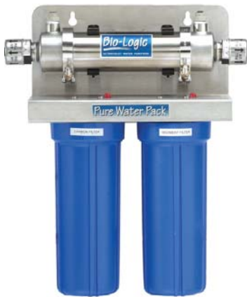
Model BIO-1.5 PWP 1.5 GPM