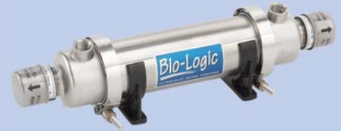
Model BIO-1.5 1.5 GPM