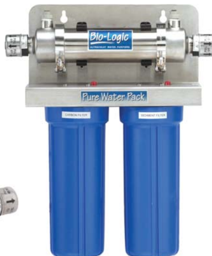
Model BIO-1.5 PWP 1.5 GPM