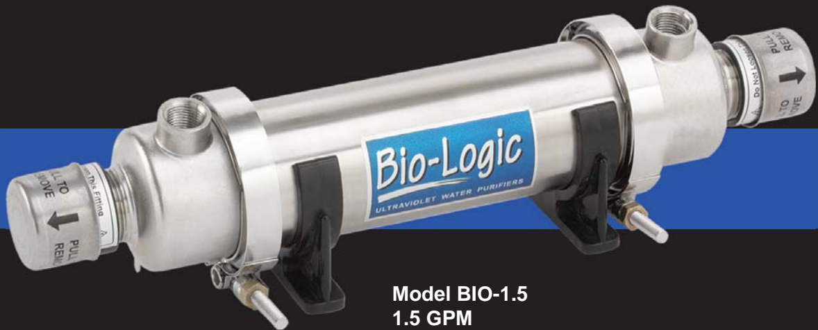
Model BIO-1.5 1.5 GPM